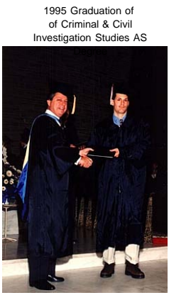
1995 Graduation of Criminal & Civil Investigation Studies AS