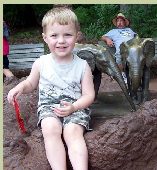
Here is the Founder's Son at the zoo being very much loved and cared for as always, before the Wilkes County Court took him from